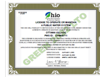
Copy of Village of Ottawa Current License

January 1, 2022 License to Operate or Maintain a Public Water System (6900711-1204021-2018) "Green" The OEPA, Pursuant to Section 6109.21 of the Ohio Revised Code, Hereby Issued a License to Operate or Maintain a Public Water System to Ottawa Village, Which Expires on January 30, 2023.