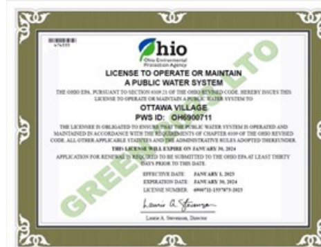
Copy of Village of Ottawa Current License

January 1, 2023, License to Operate or Maintain a Public Water System (6900711-1204021-2018) "Green" The OEPA, Pursuant to Section 6109.21 of the Ohio Revised Code, Hereby Issued a License to Operate or Maintain a Public Water System to Ottawa Village, Which Expires on January 30, 2024.